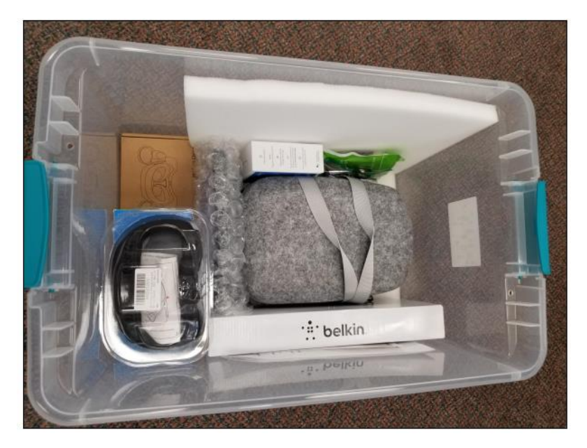
Step 7: Put foam around the sides of bin

Step 6: Continue putting items back in bin as shown below